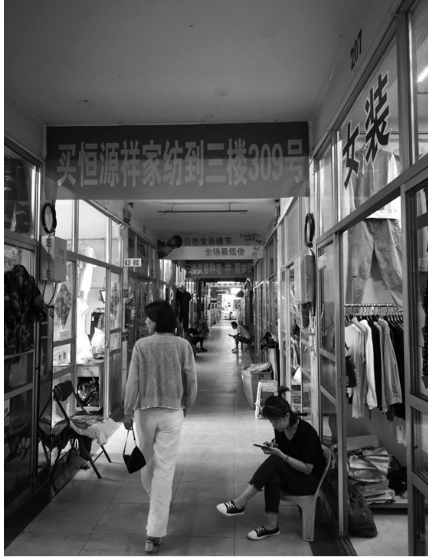
Meng Xuan, 'Time Tunnel,' 2022